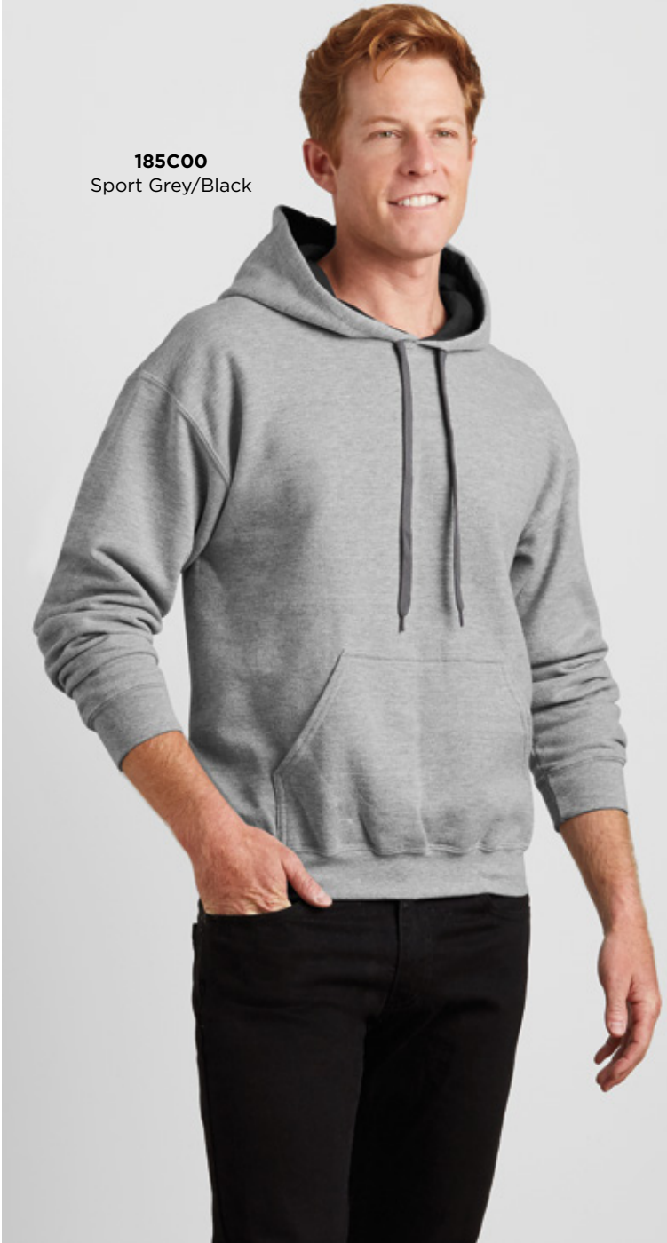
185C00 Sport Grey/Black

Style offered in Adult and Youth sizings N = New colour to this style