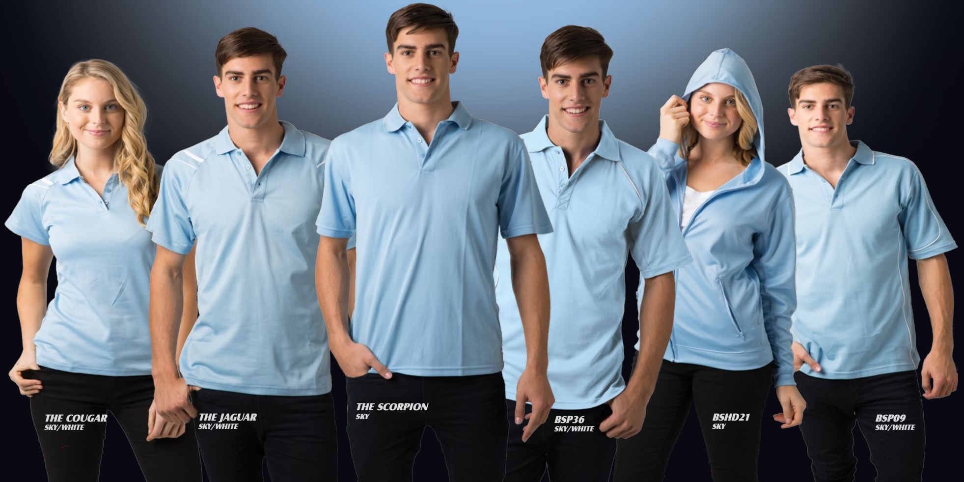
THE COUGAR SKY/WHITE