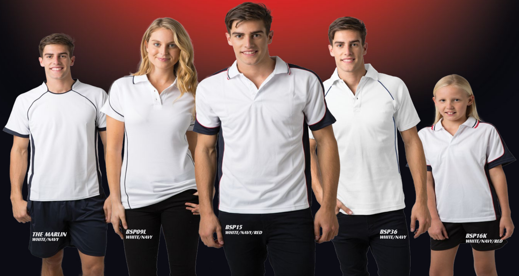
THE MARLIN WHITE/NAVY