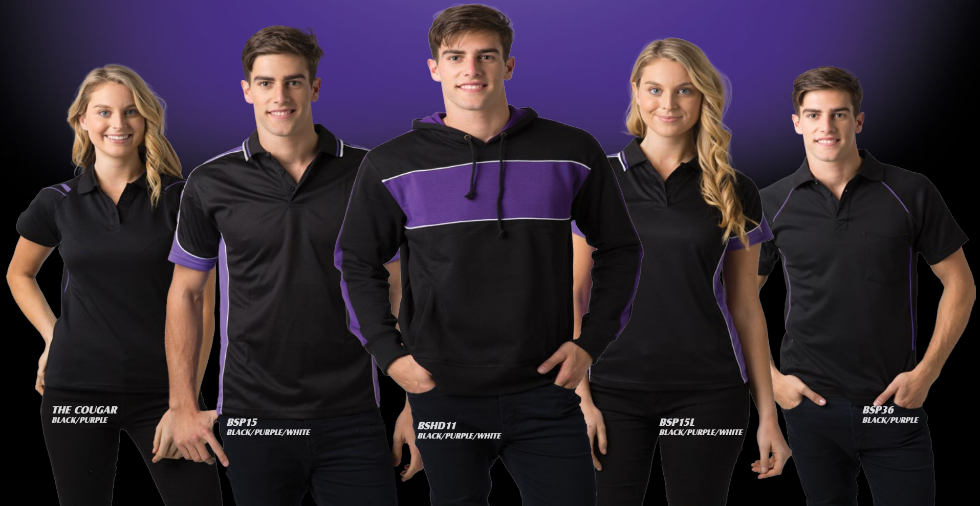
THE COUGAR BLACK/PURPLE